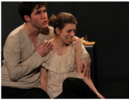
Isabella in Measure for Measure