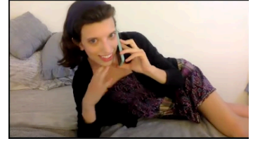
Hermia in A Midsummer Nights' Zoom