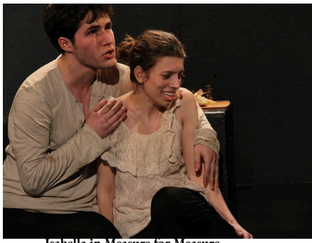
Isabella in Measure for Measure